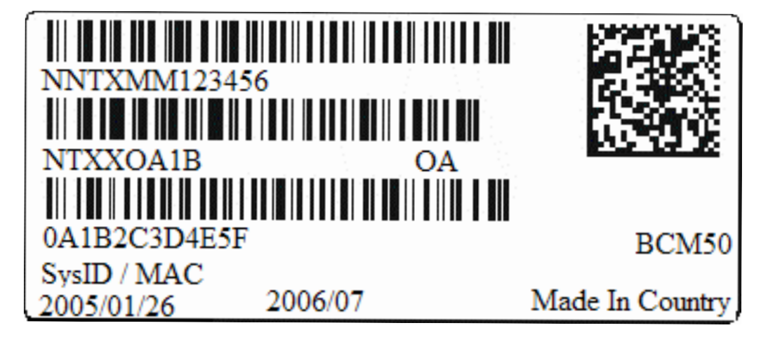
Figure 1 Product label sample

Your can find the system ID in Element Manager and on the product packaging (see Figure 1).